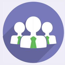
Management support and coaching