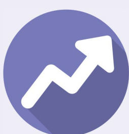
Clear pathways/ career development and promotion opportunities