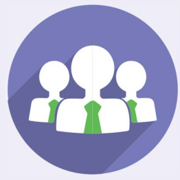
Management support and coaching