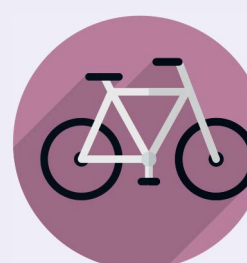
Cycle to Work Scheme