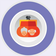
Employer pension contribution