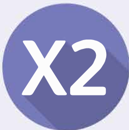
Double time for Bank Holidays