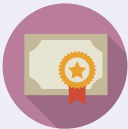
NMC Pin paid by Hafod