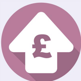
Enhanced overtime rates