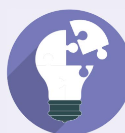
Personal development planned to NMC revalidation/